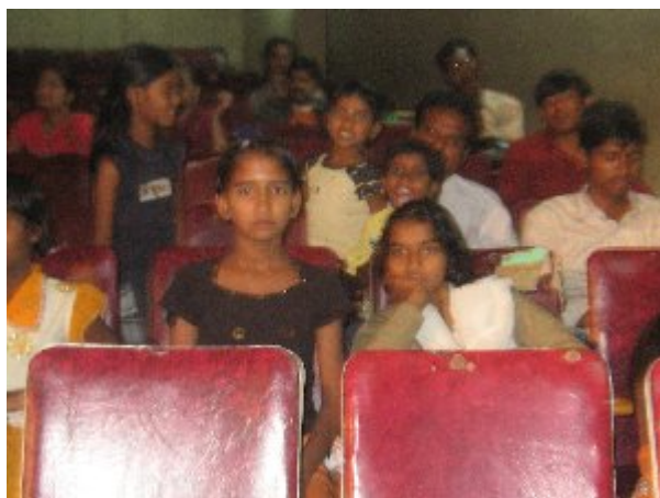
Girl-Child Day, Jan 24 th :